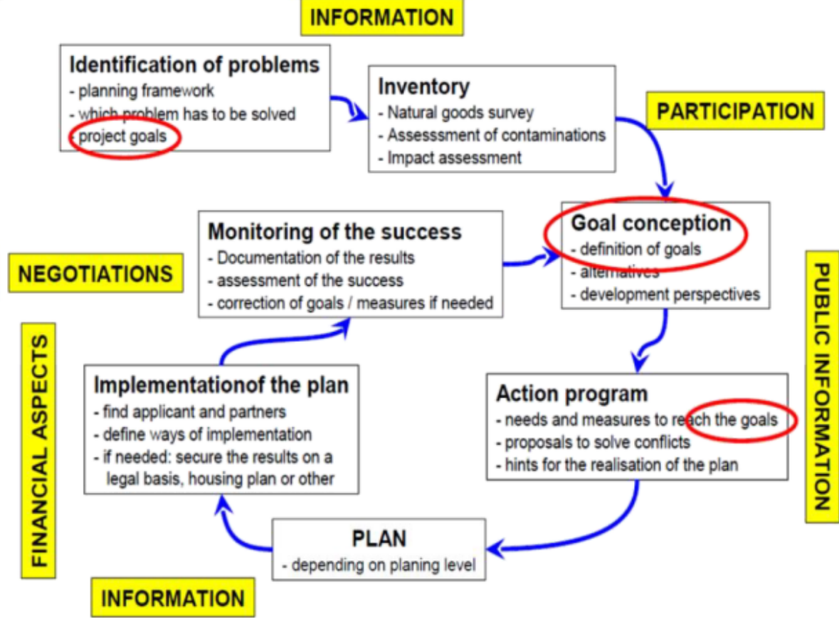
Rammert, U (2012) Sample project planning and realization cycle

It starts with the analysis of information by identifying project goals and doing an inventory of natural ressources, the recent situation, options of activities, and maybe even the skills and abilities of the team members (see chapter 2). The next step is participation of collaborators (if necessary) which is important to create a goal concept, an action plan and make it transparent. Afterwards these central aspects of a plan need to be adapted to the planning level and transferred into a more concrete implementation structure of the plan. Finally the monitoring/evaluation of success during or after the implementation of a project is elementary to proof or adapt the goal concept of a project. The steps of the process can also be found in some more detail in the organisation of the "Case Study Method Tool" which has been used as a basis of analysis during the Benefit4Regions project. This procedure/these steps on the one hand will lead towards a structured and understandable project management plan which fits for all stakeholders and can be change in the specific context of a project. On the other hand the plan as well as the scope of the project needs to be adapted to different circumstances and stakeholders. Especially in more complex projects different types of competence should be regarded: